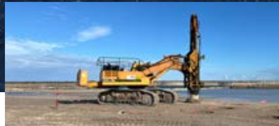
Compaction to stabilise the reclaimed land begins.

While current weather conditions are favourable for the earthworks, we are prepared for the dry conditions and have commissioned several water sources across site to support dust suppression. An appropriate dust suppressant agent is available for immediate ground stabilisation. For areas that will not be accessed for long periods of time, hydromulch will be used to stabilise these earth worked areas.