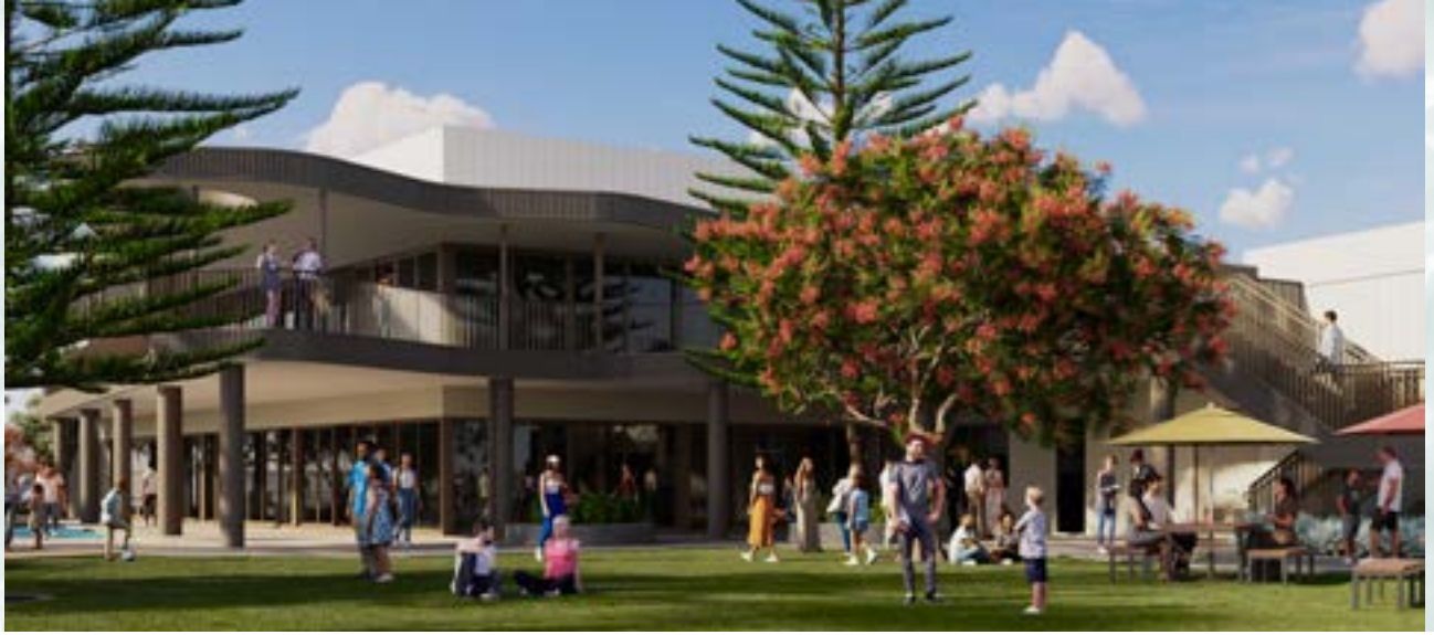
Ocean Reef Sea Sports Club (ORSSC) - Artist impression only.